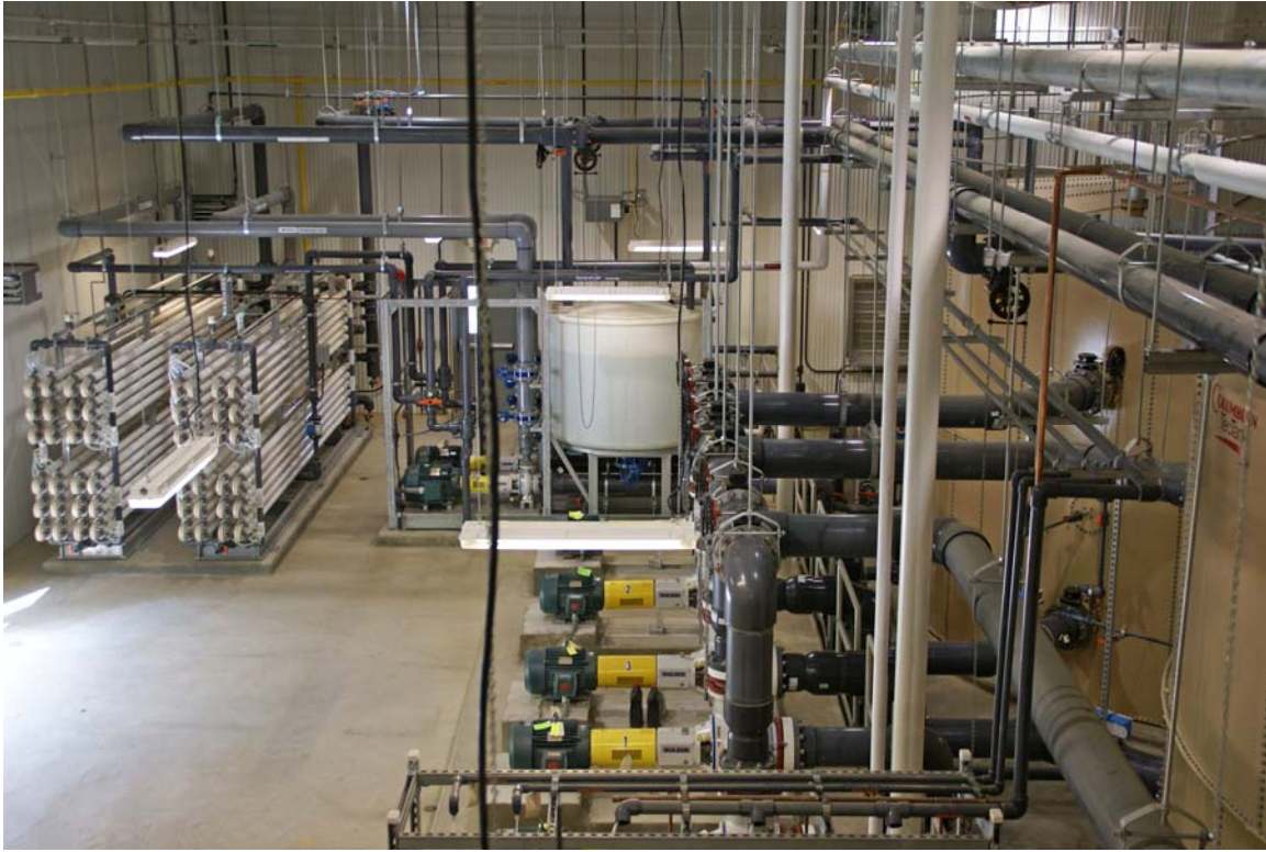
Figure 2. General View of the MBR Facility

The design MLSS concentration range was specified as 10,000 to 15,000 mg/L. The raw leachate is pumped to a single, 80,000 gallon (approximate working volume) anoxic tank mixed with a submerged jet mixing system, where it is combined with mixed liquor returned from the membrane reject (Figure 3). Partially denitrified effluent is split and flows by gravity to twin, 60,000 gallon aerobic tanks (approximate working volume) with jet aeration systems. With the overall working system volume of approximately 200,000 gallons, the design average F/M of the system at 10,000 mg/L of MLSS is 0.04 #COD/#MLSS-day (including anoxic volume).