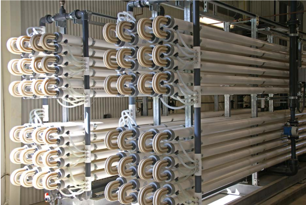
Figure 4. Battery of the UF Membranes