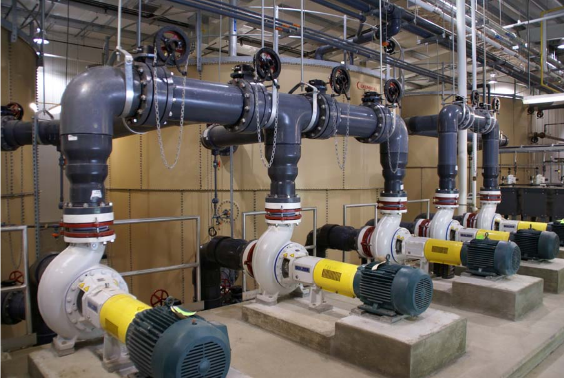
Figure 3. Reaction Tanks and Aeration/Mixing Systems

The mixed liquor is separated from the effluent by a battery of membrane filtration (ultrafiltration) units. Two independent, pre-engineered membrane systems, each with a capacity of 50,000 gpd, were provided. Normally, only one system is expected to be on line. Each system consists of 48 tubular, cross-flow membranes, mounted in eight (8) parallel modules, each with six passes (six (6) membranes in each module) (see Figure 4). An individual membrane consists of a 3½ - inch diameter PVC pipe, in which seven (7) individual ultrafiltration tubes are housed. The mixed liquor is pumped at a high surface velocity across the membranes using a 580 gpm (16.7 times forward flow), high pressure pump. The reject stream is divided between the suction side of the membrane feed pumps with the balance returned to the aerobic and anoxic tanks. In-place membrane cleaning system with acid is provided.